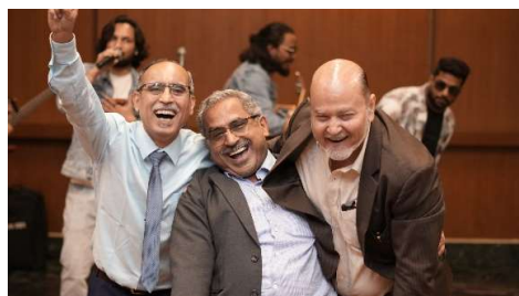
"...And; so was the spirit!"