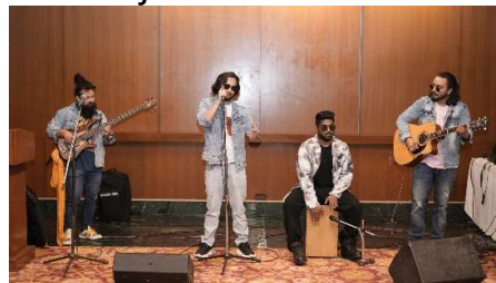
NAZM UNPLUGGED – It had to be felt & enjoyed!

The afternoon seminar event of CMMI-Delhi culminating in creation of festal atmosphere in the late evening was a first! CMMI-Delhi helped, one and all, to flow into the mood to enjoy a Gala Dinner, where ambience was set by the tunes of NAZM UNPLUGGED – a fusion band with a blend of Sufi, Rock & Indian classical music. Nothing more needed to be said; it was just meant to be enjoyed! There were intense discussions; there was catching-up, gup-shup with the "tadka" of galley news and with high spirits of an evening that turned out to be the zenith of a job well done!